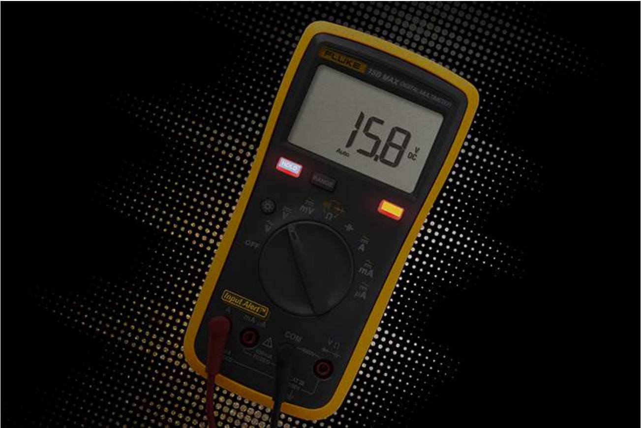
Audible and visual alarm for incorrect connections